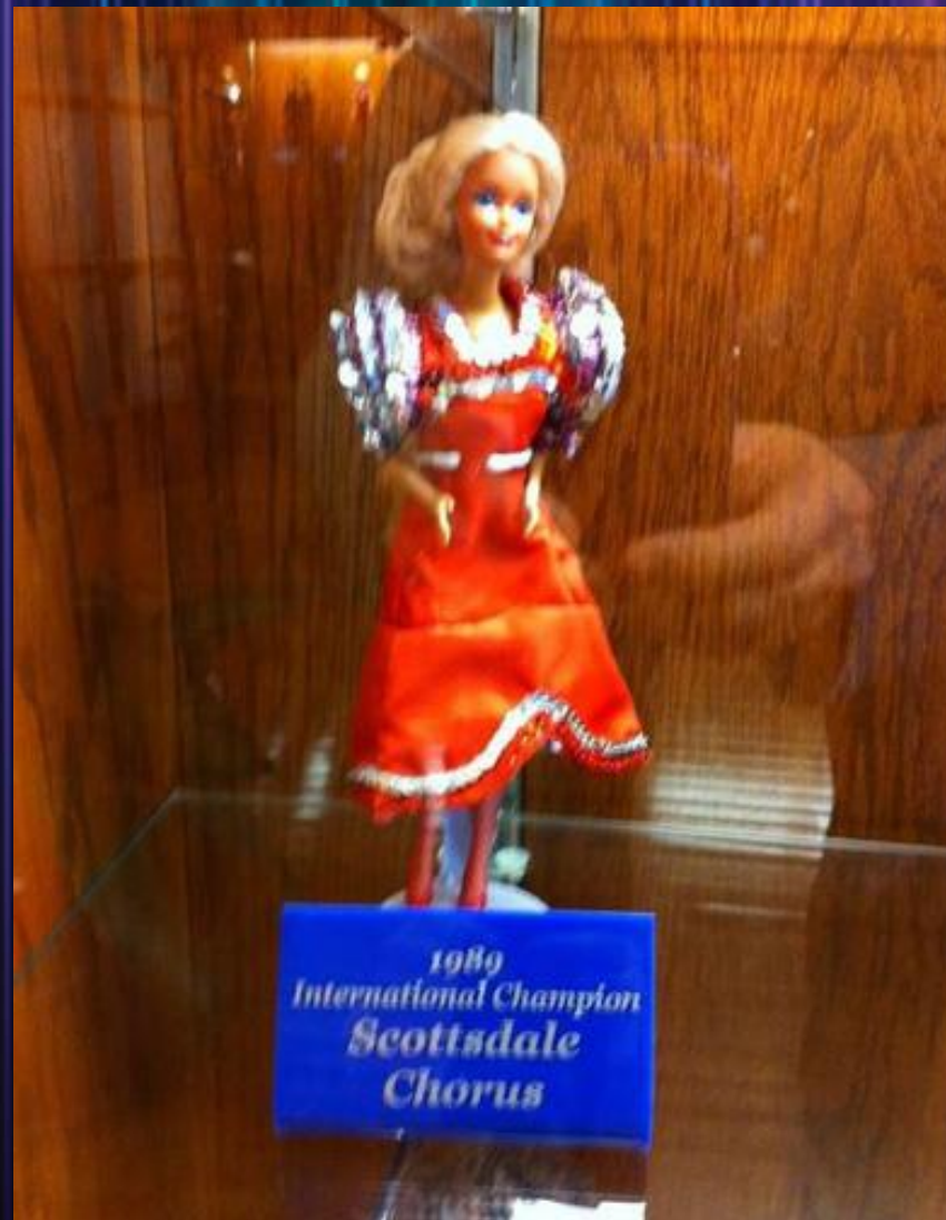
The Miami Barbie doll on display at Sweet Adeline International Headquarters in Tulsa, OK