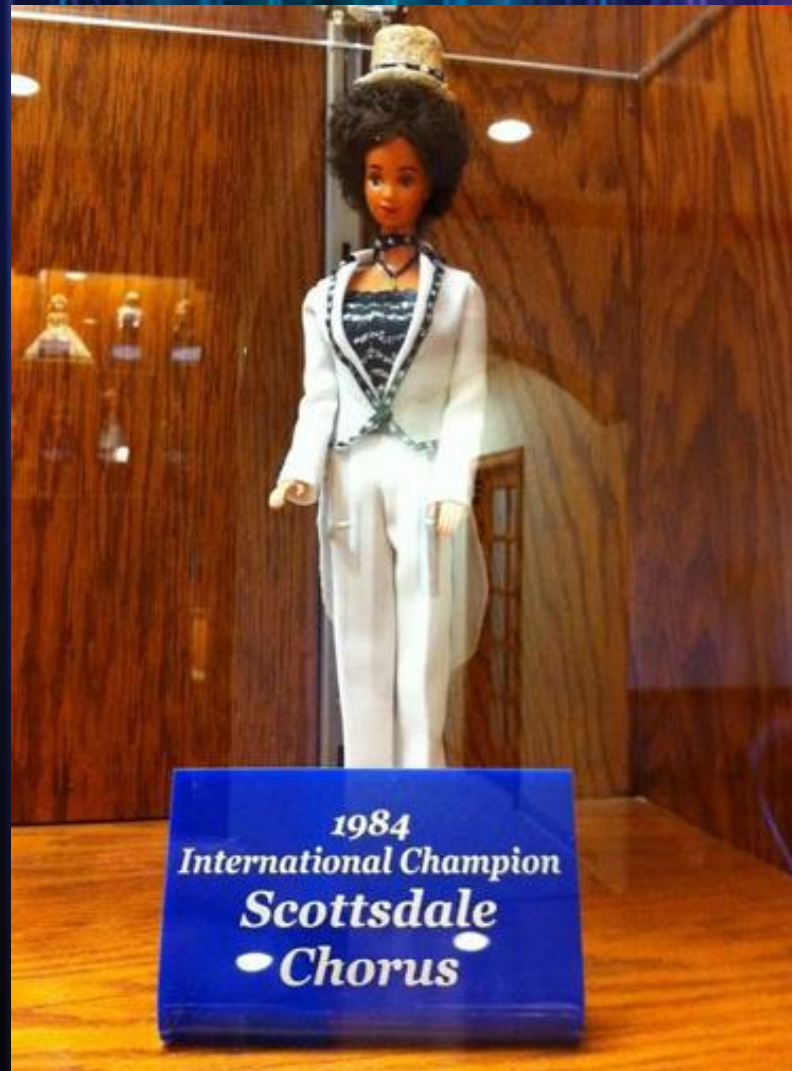
The Las Vegas Barbie doll on display at Sweet Adeline International Headquarters in Tulsa, OK