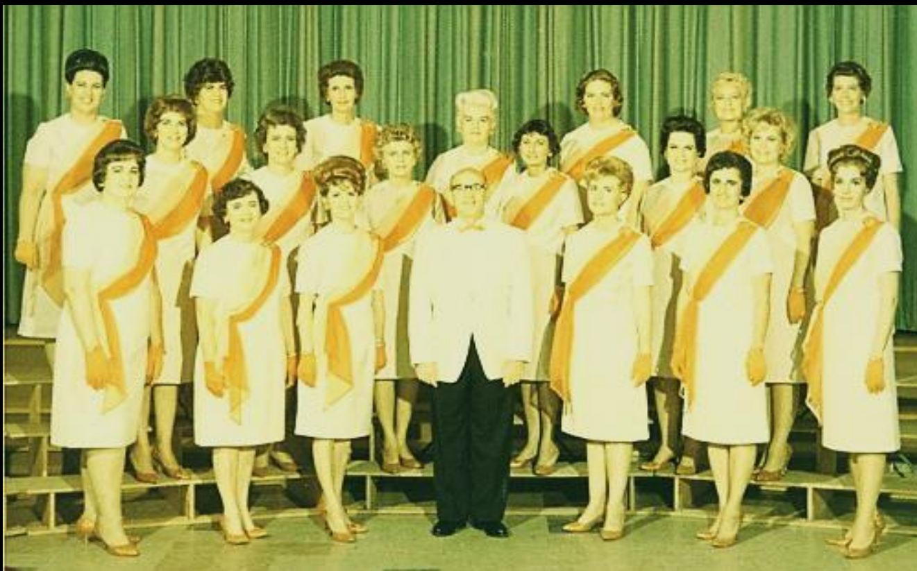
The Chorus at their first Regional Competition in the spring of 1966.