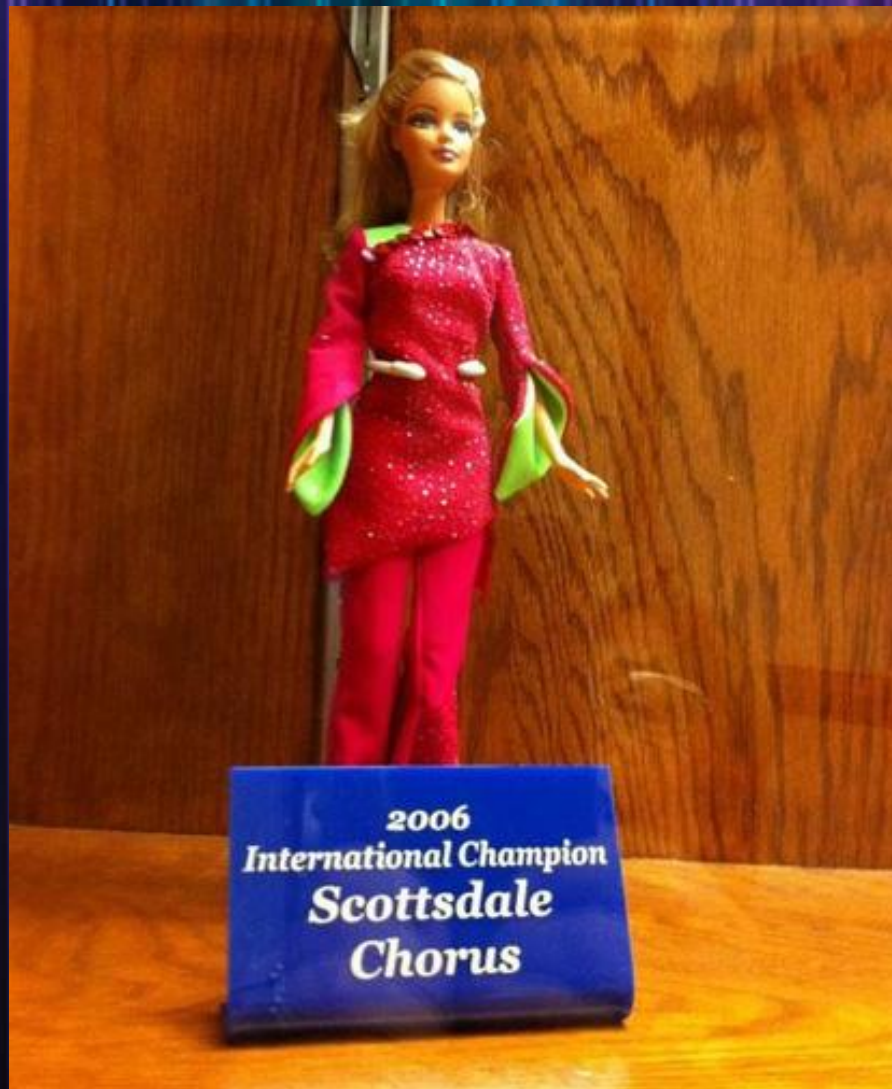
The Detroit Barbie Doll on display at Sweet Adeline International Headquarters in Tulsa, OK